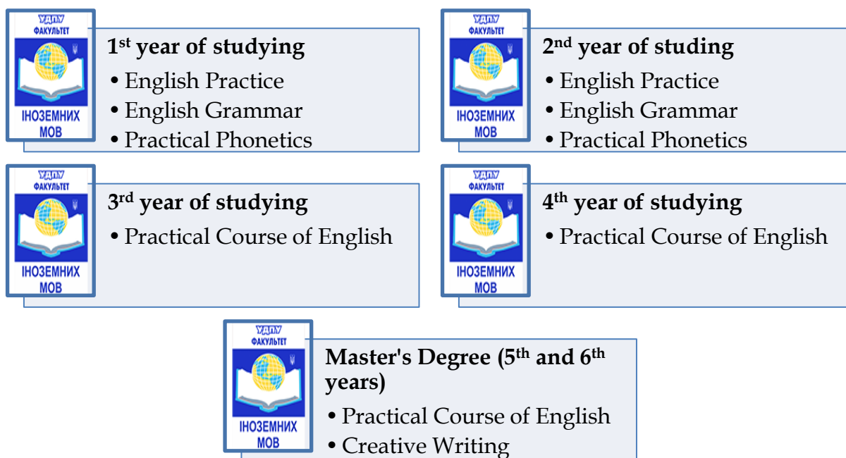
Figure 1. Compulsory Practical English Courses at Faculty of Foreign Languages of USPU

It is apparent from the analysis of methodological literature that most of tasks classifications take into account the gradual development of students' skills and abilities. This fact is clearly demonstrated in textbooks focused on learning a foreign language at secondary schools. We believe that such a sequence is difficult to note in the textbooks and manuals for teaching English at higher education (we analyse teaching aids and manuals at Faculty of Foreign Languages of USPU). This is explained by the specificities of teaching the main compulsory English practical disciplines at each level of studying (Fig. 1) and students' high level of English (this conclusion was made on the analysis of students' tests results at the end of each course).